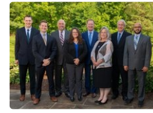
HFS Wealth Advisors HFS Wealth Advisors

https://www.financialarchitectsllc.com/Ruminations%20Files/Ruminations%20on%20Calendar%20Effects%20on%20Stock%20Returns.pdf