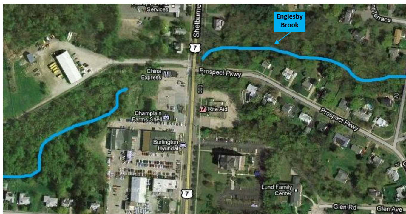
Figure 4: Aerial view of Englesby Brook near some commercial development along the Shelburne Road Corridor

Many wetland acres within the Northern Lake Champlain Basin and within the Englesby Brook watershed have been degraded by urbanization and land development activities. Burlington only has 600 acres of wetlands remaining, as most of the wetland areas within the city have been filled in for development (Burlington, 2006). Wetlands play a critical role in reducing runoff pollution and help with flood attenuation. Removing wetlands and developing along a stream's bank, as seen in the Englesby Brook watershed, restricts the brook's access to its natural flood plain and converts areas that once played a critical role in filtering runoff, into areas generating polluted stormwater directly adjacent to the brook (VTANR, 2007). Figure 4 provides an aerial view of Englesby Brook around 0.7 miles up from its confluence with Lake Champlain. This photo shows that there is development directly on the stream bank and within what was once the brook's natural flood plain.