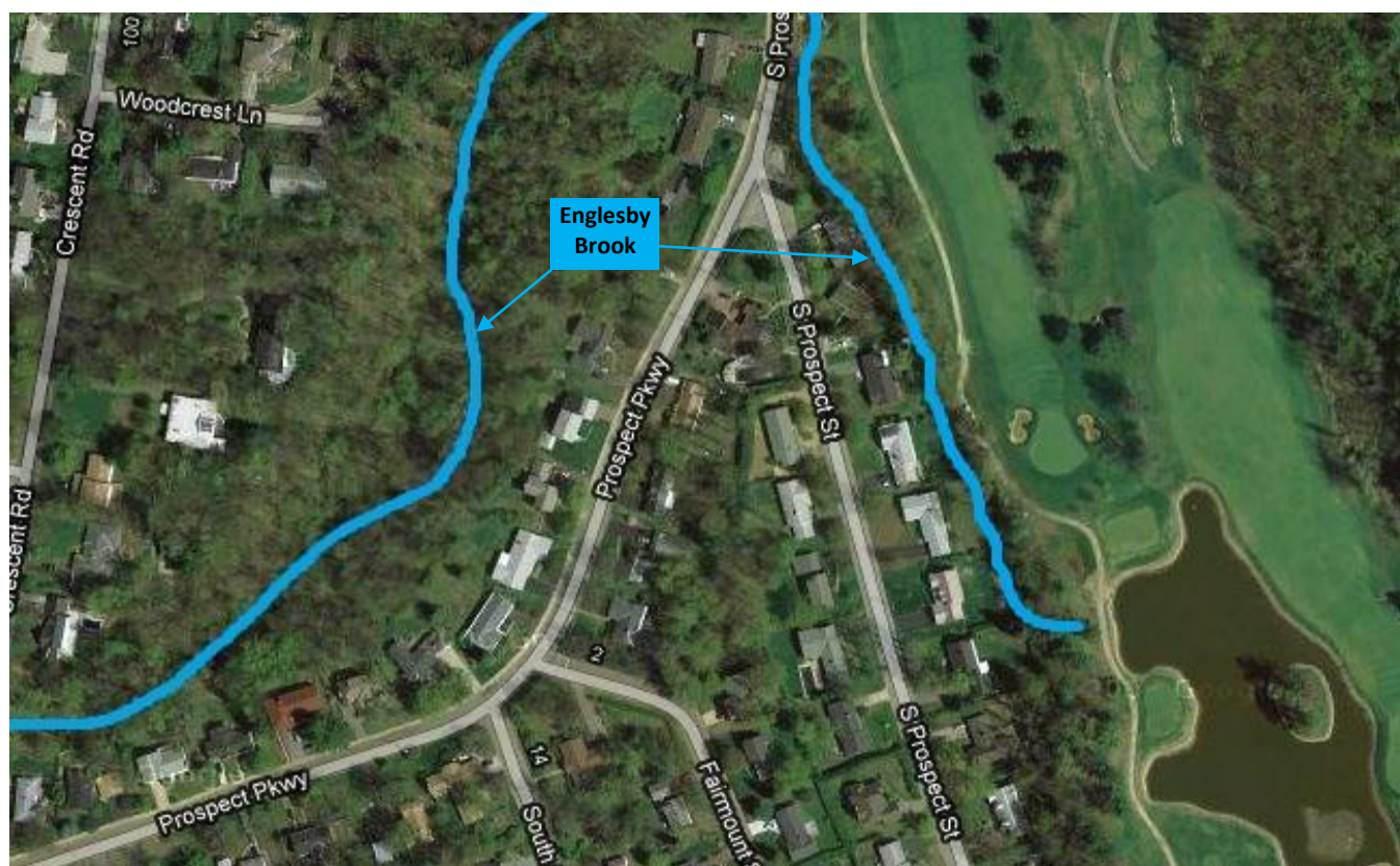
Figure 3: Aerial view of Englesby Brook near its headwaters within the Burlington Country Club.

Figure 3 provides a more detailed aerial view of Englesby Brook near its headwaters. The stream leaves the golf course impoundment pictured above before it flows west through dense residential development. The primary type of development within the watershed is single family residential with other significant development types being commercial development along the Shelburne Road corridor with some industrial areas located in the lower portion of the watershed (Englesby, 2007). Englesby Brook receives a stormwater runoff from these developed areas.