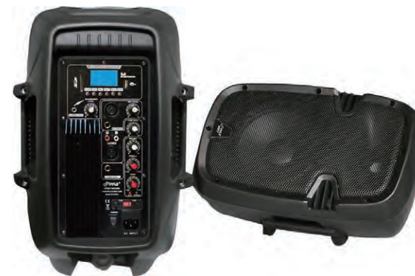
2-Way High-Powered Speaker with MP3, Wireless BT Music Streaming, Record Function, USB and SD Memory Readers & Remote Control

By pressing the ' REC ' button you will have the ability to record to your USB and SD memory cards. Once your selected memory device is inserted (ei. USB Flash or SD memory card) you will be able to record and delete audio files directly from the speaker's control center and LCD screen.